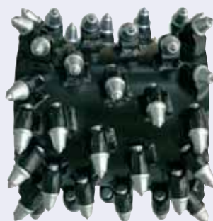
Drum for wall profiling