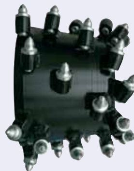
Drum for soft material