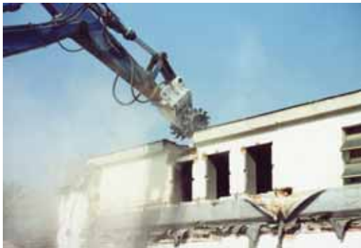
It permits a precise partial or total demolition of buildings, walkways and floors. Low vibrations transmitted to the surrounding area.