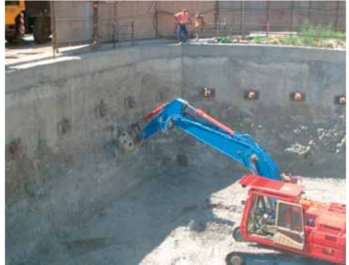
Demolitions and rough wall profiling, even with bracing, without damage to adjoining buildings.